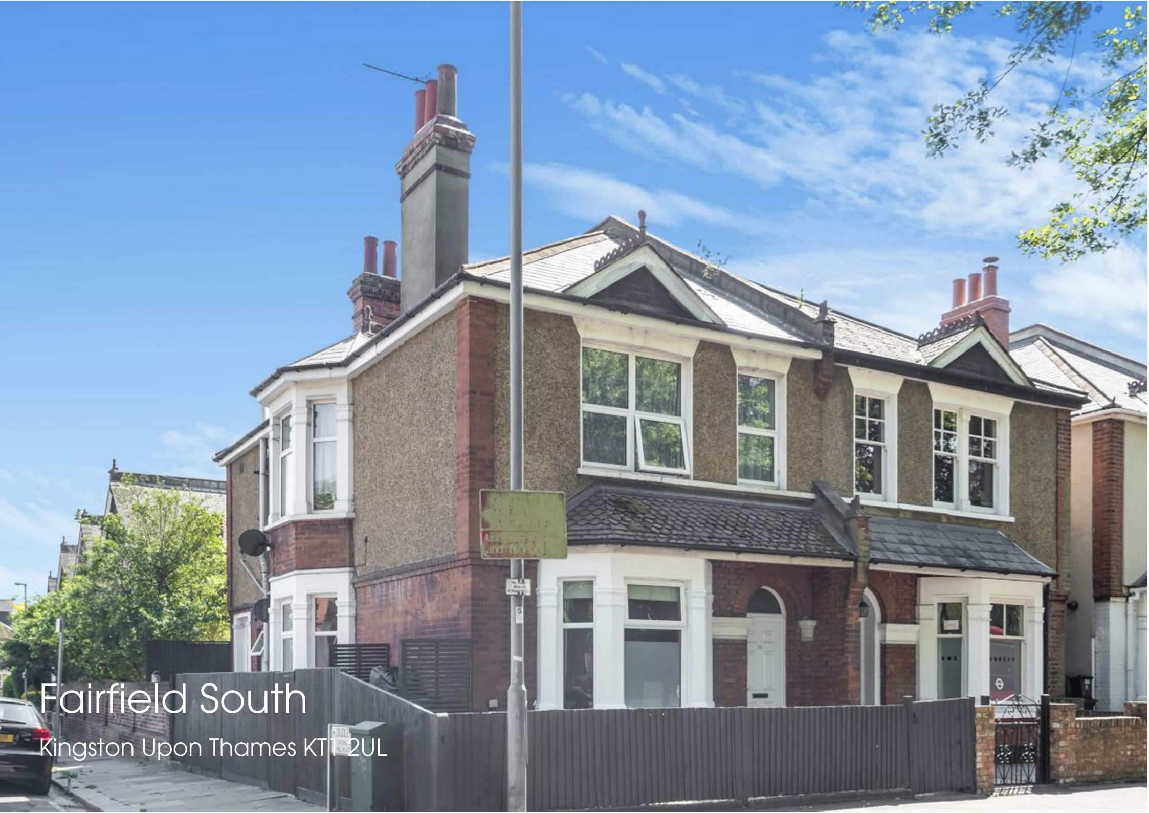
Fairfield South Kingston upon Thames KT1 2UL